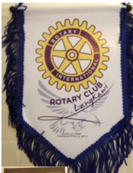
Above: our banner Left: the souvenir book